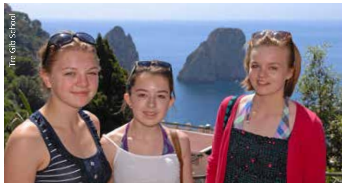
The Glib School

Call +353 (0)1 894 0300 Email info@nst.ie Visit nst.ie