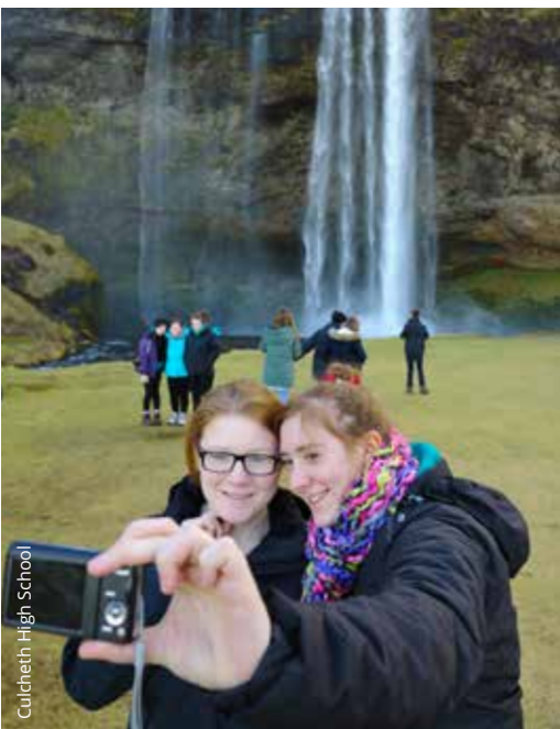
Culcheth High School