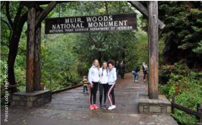
Preston Lodge High School